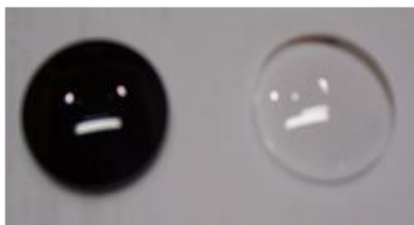
BEFORE & AFTER CLEANING COMPERISION